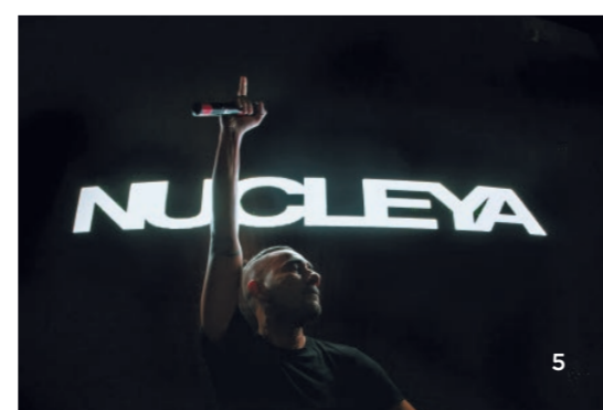
1 Sizzle and pop at Agni at The Park, New Delhi 2 The many facets of Kismet at The Park, Hyderabad 3 Glam warmth at Rovy at The Park, Kolkata 4 Larger than life: DJ Ma Faiza 5 Jumpstarter: DJ Nucleya